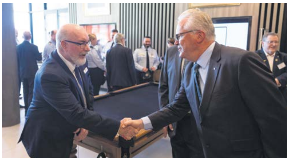
Tornado GR4 official handover