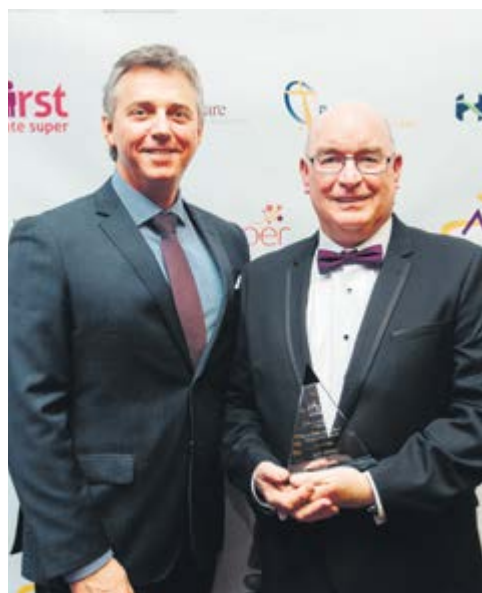
Aged Care and Community Service Excellence in Care award winner

consumer expectations were and how to respond to them.