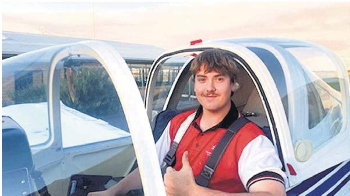
Dylan goes solo

Learning to fly is something many aspire to and being able to help make that dream a reality for three deserving young people was a proud moment for RAAFA.