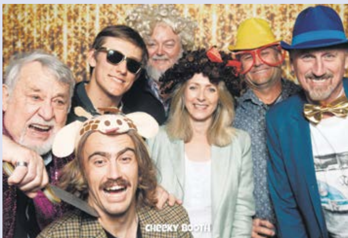
Residents 80th birthday celebrations

A la Carte night 4th Wednesday of every month