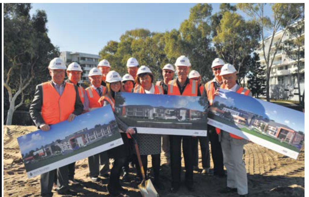
Alice Ross-King Care Centre tuning of the sod